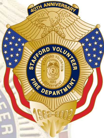
Full color art

For over 75 years we've been designing and manufacturing the highest quality Badges, Name Bars and emblems available.