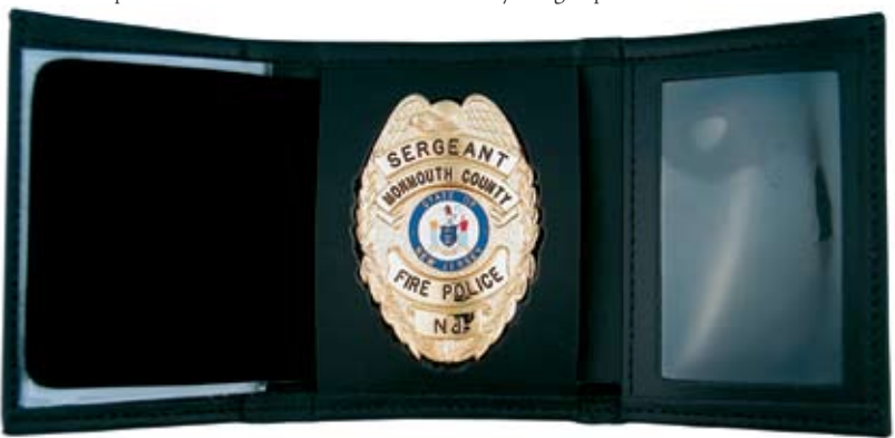
BC-14 Tri-Fold Wallet Case

Perfect fit recessed badge cut on front of case, with two I.D. windows inside separated by black suede protective flap. Will accommodate any badge up to 3" x 2¾".