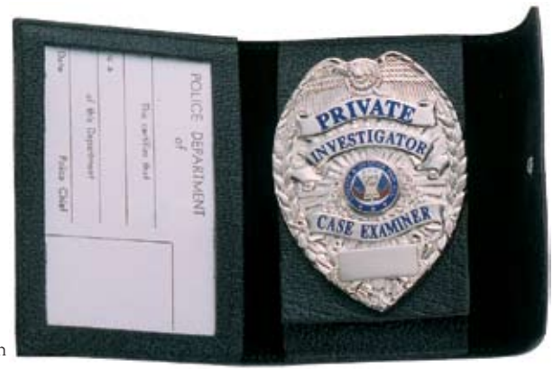
BC-I.D. Identification Badge Case

Durable metal belt clip with velcro closure. Fits badges up to 3½" x 2½"