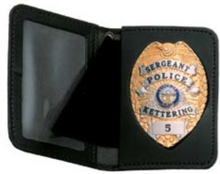
BC-5 Custom Cut Badge Case (shown) BC-6 Standard Cut Badge Case

Customize with one or two bars along with a badge. Measures 4½" x 2¾"