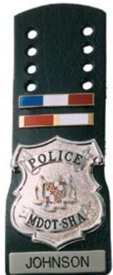
BC-CH2 Citation & Badge Holder

Perfect fit recessed badge cut out and rich black suede protective flap. Will accommodate any badge up to 3¾" x 2½".