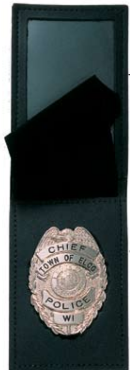
BC-8 Vertical Badge Case

Other styles are available, please call for details.